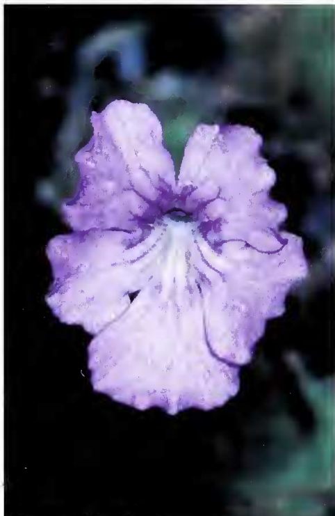
Figure 1: Pinguicula 'Hanka'